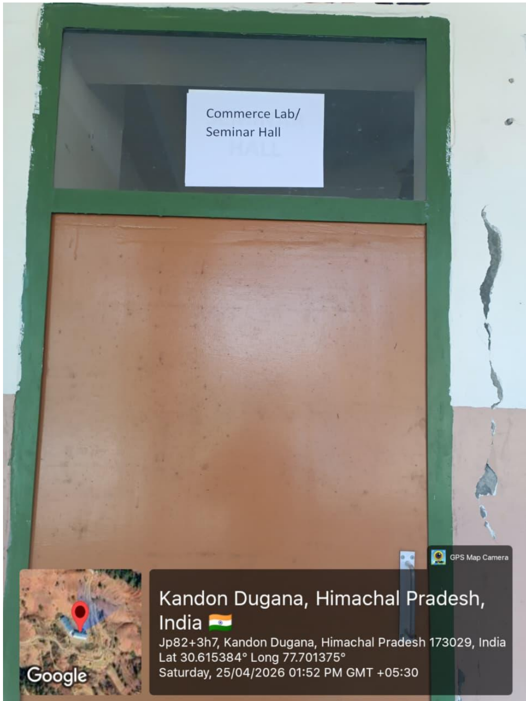
Figure 3 Seminar Hall Outside