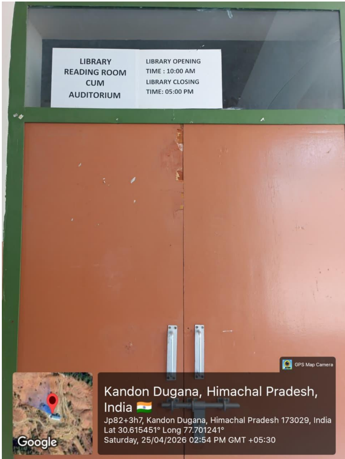
Figure 1 Auditorium Outside