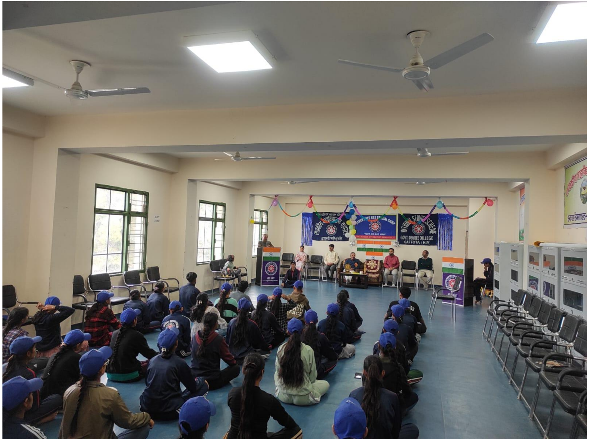
Figure 2 Auditorium Inside