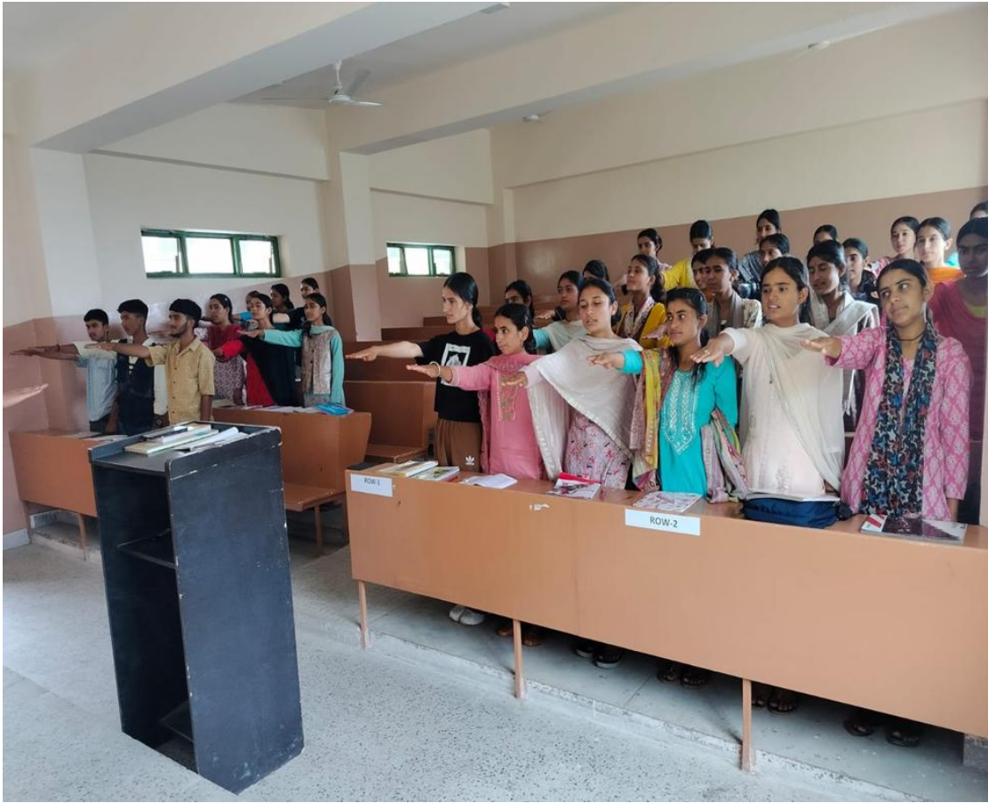
Figure 4: Students taking anti-drug pledge

Anti-Drug Pledge Ceremony Drug ceremony celebrated and pledge has been taken by all the students. They have also generated certificates by taking online pledge.