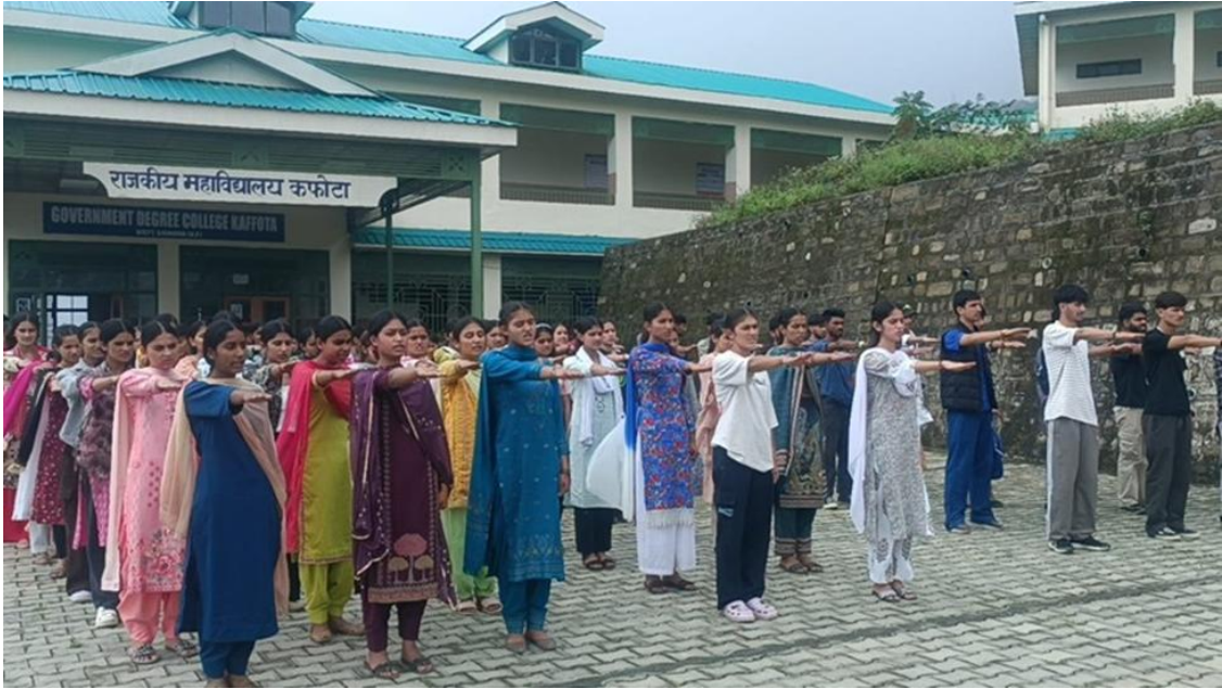
Figure 3: Oath taking by students on Anti-Drug

Each year, the Anti-Drug Cell hosts an Anti-Drug Oath Taking ceremony, where students and staff commit themselves to a drug-free life. This formal pledge underscores the significance of a collective stand against substance abuse and symbolizes the college community's united commitment to health and wellbeing. By actively participating in this ceremony, students and staff renew their resolve to maintain a healthy lifestyle, free from drugs and harmful substances, reinforcing the college's stance on substance abuse.